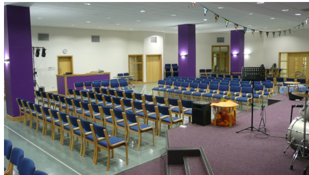
Conference Hall A popular venue for events in Cumbernauld

Facilities can be adapted as required to suit the purpose of the let. Cornerstone Café , an on-site café and restaurant, is open Monday-Saturday and can easily be accessed by those hiring space or visiting the Centre.